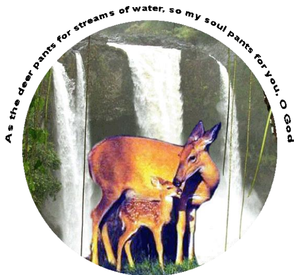
Psalm 42 v1