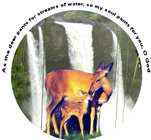
Psalm 42 v1